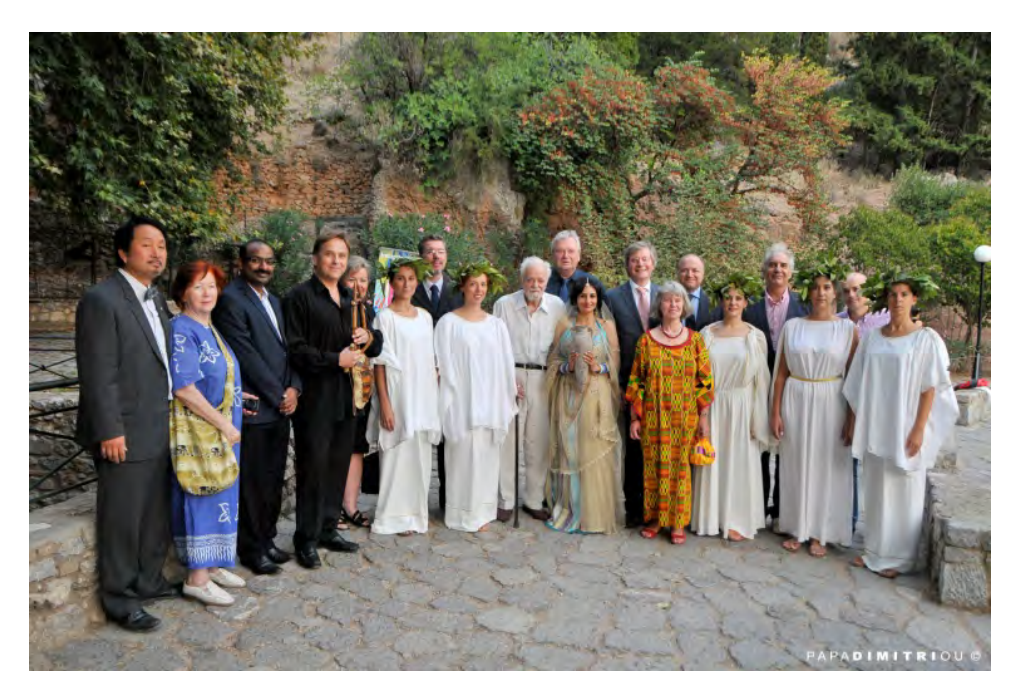
Water Ceremony at the Castalian Spring in Delphi, Greece; September 2015

The Delphic Art Wall Project under the MOTTO "Paint your Picture of Europe" unites societies in the interest of future generations – the true barometer of values.