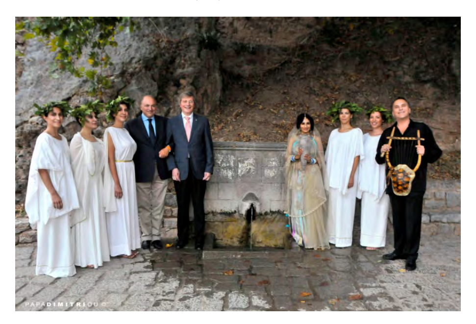
Water Ceremony at the Castalian Spring in Delphi, Greece; September 2015

Delphi is the birthplace of the Delphic Games.