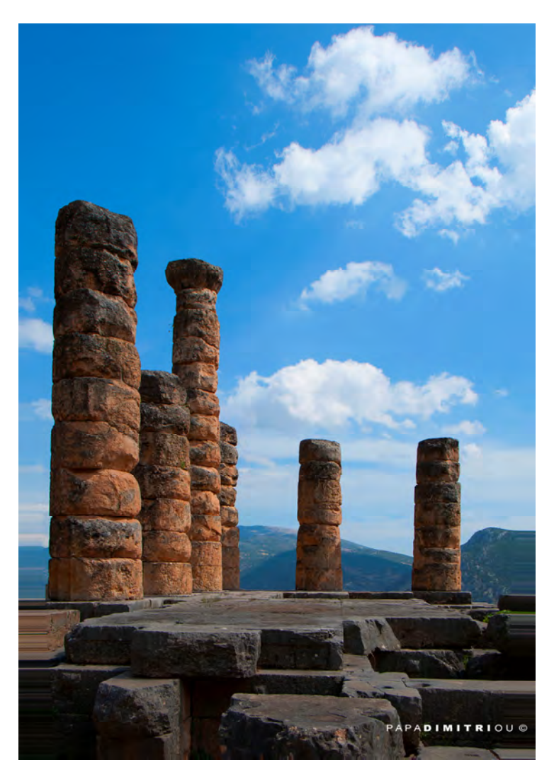
Temple of Apollo in Delphi, Greece