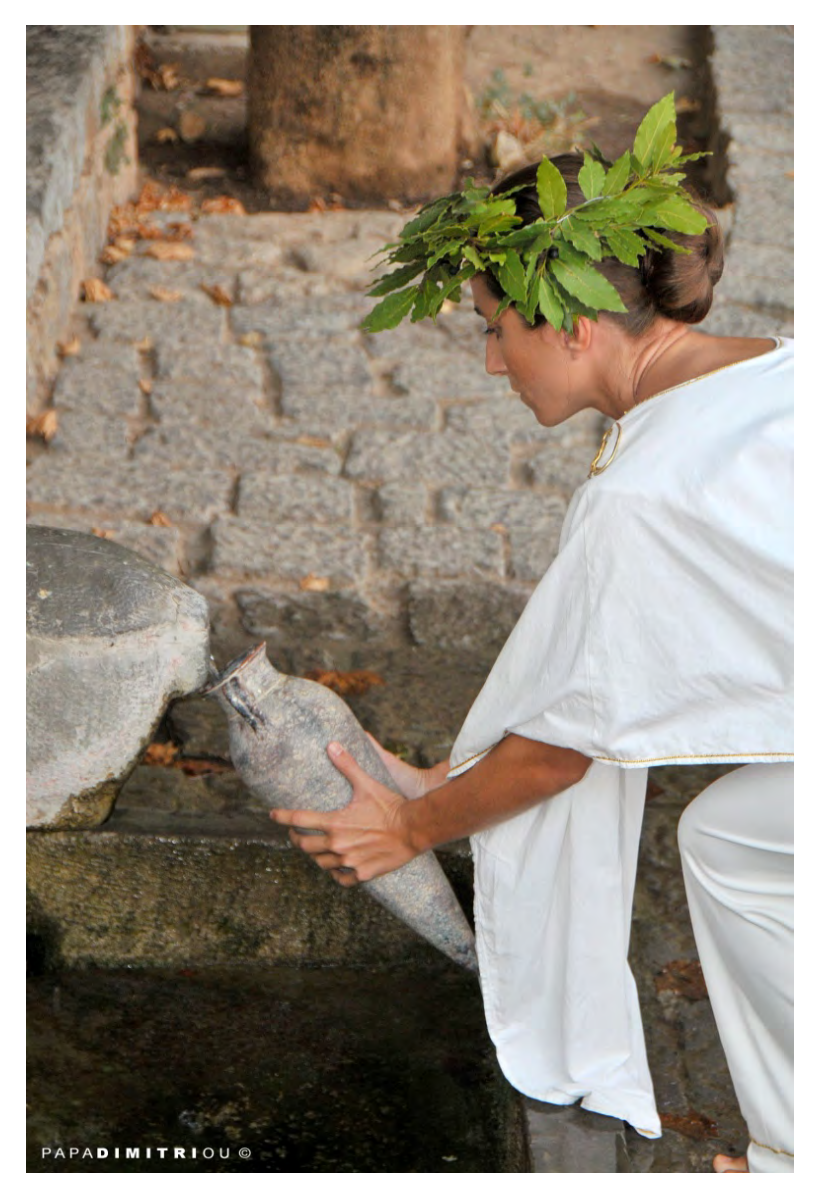
Castalian Spring in Delphi – Water the symbolic element of the Delphic Games

Delphic Games Youth Delphic Games Delphiads