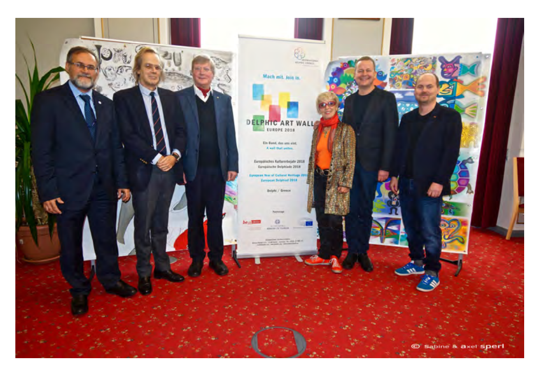
Delphic Art Wall presentation in Berlin 2017