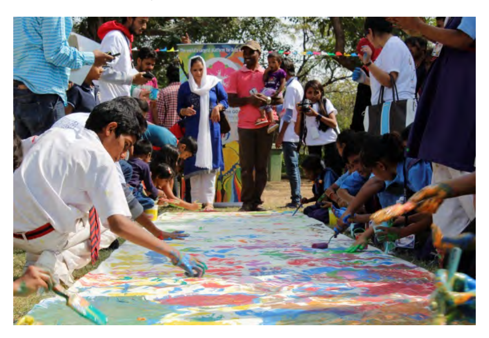
Sanjeeviah Park, Hyderabad, India; November 2015

The first Delphic Art Wall has covered over 30 schools in Project Hyderabad, and has received more than 200 art works.