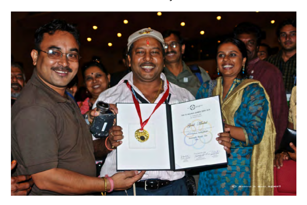
Gold medal winner of the III Delphic Games 2009, Jeju, Korea

We live in a time that is dominated by cynicism, mistrust, insecurity and fear. In a world that has the internet – a tool that can connect, engage and enlighten – fanaticism, fundamen-talism and populist nationalism are on the rise. In the age of democracy and liberal thought, refugees are being neglected and problems of the minorities are growing. Migration and unemployment pose unique challenges. And people are willing to commit the most heinous and violent crimes against others.